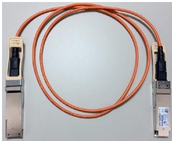
Figure 5. Cisco 40G QSFP active optics cables

Cisco QSFP to QSFP copper direct-attach 40GBASE-CR4 cables (Figure 5) are suitable for very short distances and offer a flexible way to connect within racks and across adjacent racks. Active optical cables are much thinner and lighter than copper cables, which makes cabling easier. Active optical cables enable efficient system airflow and have no EMI issues, which is critical in high-density racks. Cisco currently offers active optical cables in lengths of 1, 2, 3, 5, 7, 10, 15, 20, 25 and 30 meters.