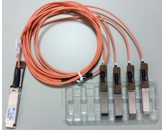
Figure 4. Cisco 40G QSFP to Four SFP+ breakout active optics cables