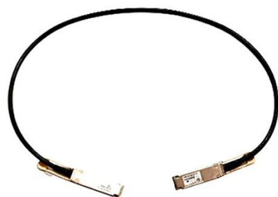
Figure 3. Cisco 40GBASE-CR4 QSFP direct-attach copper cables

Cisco QSFP to QSFP copper direct-attach 40GBASE-CR4 cables (Figure 3) are suitable for very short distances and offer a very cost-effective way to establish a 40-gigabit link between QSFP ports of Cisco switches within racks and across adjacent racks. Cisco currently offers passive cables in lengths of 0.5, 1, 2, 3, 4 and 5 meters and active cables in lengths of 7 and 10 meters.